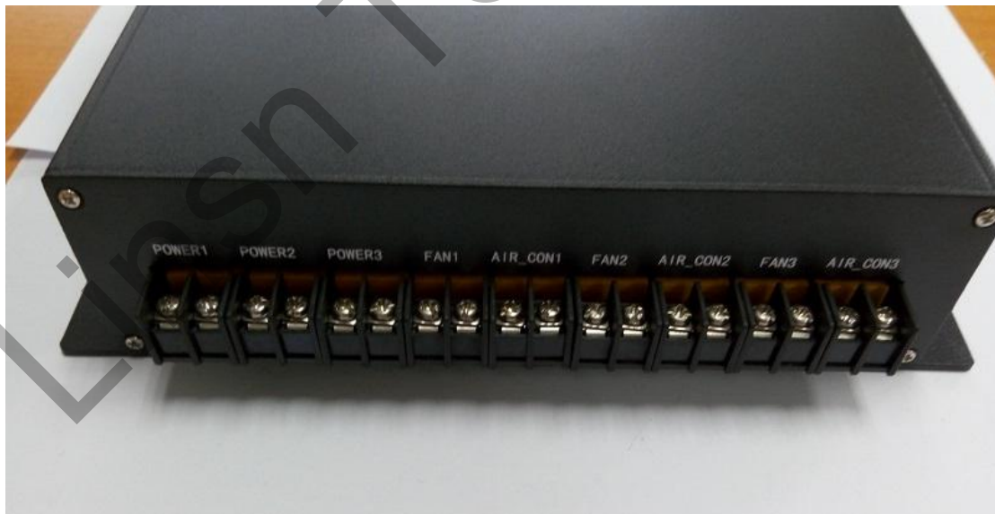
Fig 2 Interface on backside