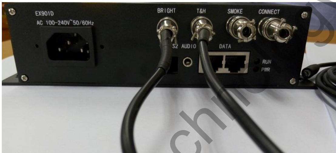
Fig 1 Interface on front side